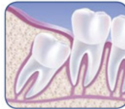
Angular, bony impaction of third molar (wisdom tooth)

In many cases, it is a good idea that trapped wisdom teeth be pulled. Depending on the location of the tooth, taking out the wisdom tooth can be done in your dentist's office.