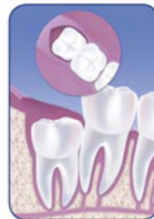
An incision is made and overlying soft tissue and bone are removed, exposing the crown of the impacted tooth.